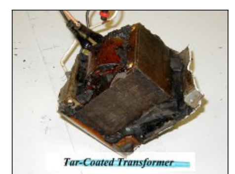
Prohibited: Tar-coated transformer