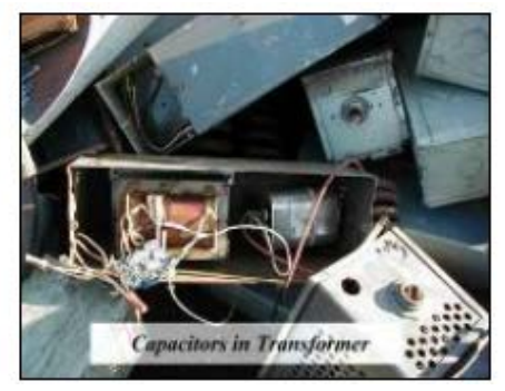
Prohibited: Capacitors in transformer