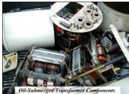
Prohibited: Transformer lamination