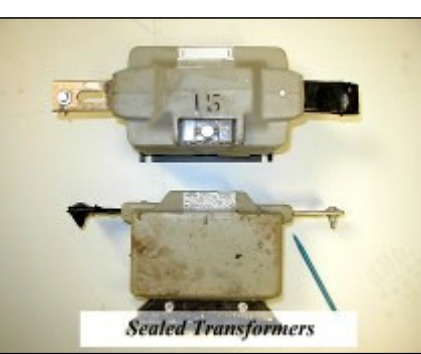
Prohibited: Sealed transformers