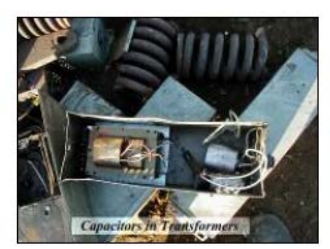
Prohibited: Capacitors in transformer