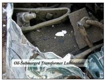
Prohibited: Transformer lamination