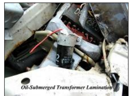
Prohibited: Oil-submerged transformer components