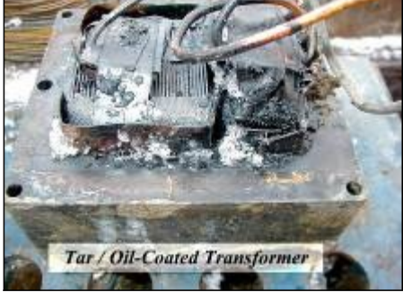
Prohibited: Tar-coated transformer