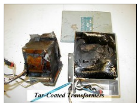
Prohibited: Tar-coated transformer