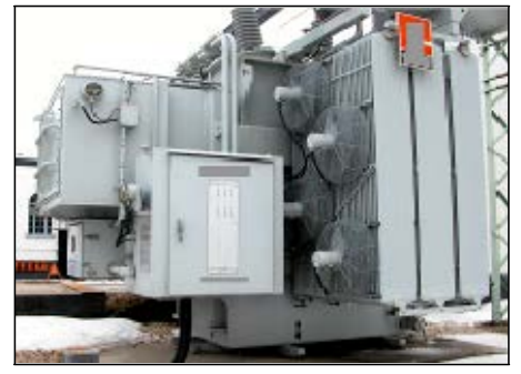
Prohibited: Transformer & components