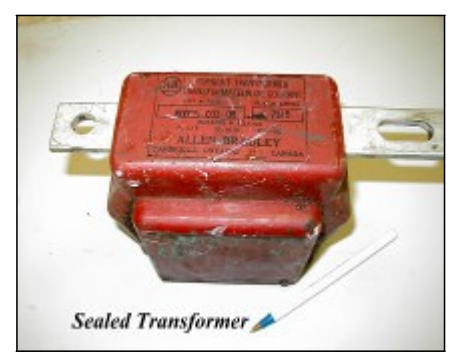
Prohibited: Sealed transformer