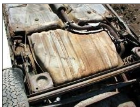
Prohibited: Un-punctured gas tank on vehicle