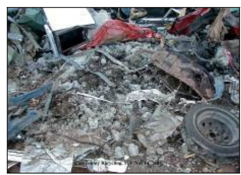
Prohibited: Non-metallic materials inside crushed vehicle