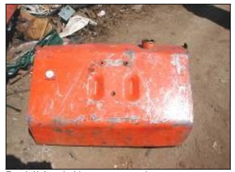
Prohibited: Un-punctured miscellaneous fuel tank