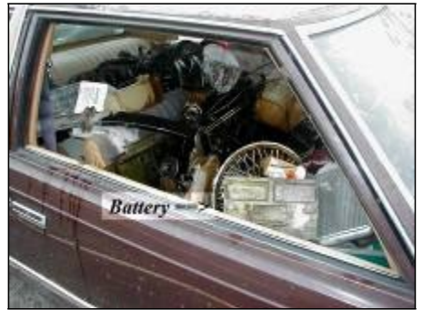
Prohibited: Lead-acid battery left in a vehicle