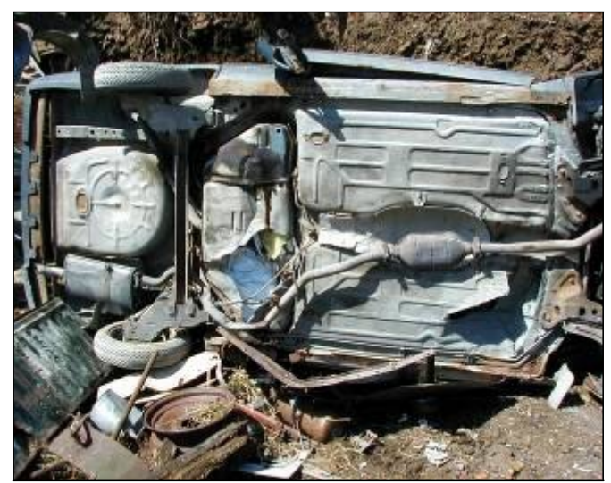
Acceptable: Gas tank on vehicle slit wide open prior to delivery to the facility