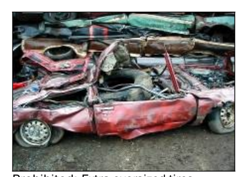
Prohibited: Extra oversized tires