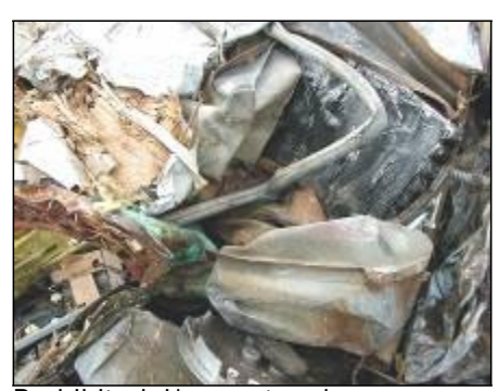
Prohibited: Un-punctured gas tank commingled with other scrap