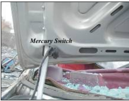
Prohibited: Mercury switch in trunk