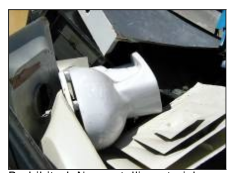
Prohibited: Non-metallic materials inside crushed vehicle