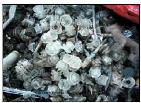
Prohibited: Non-metallic materials inside tru Phohibited: Non-metallic materials of crushed vehicle