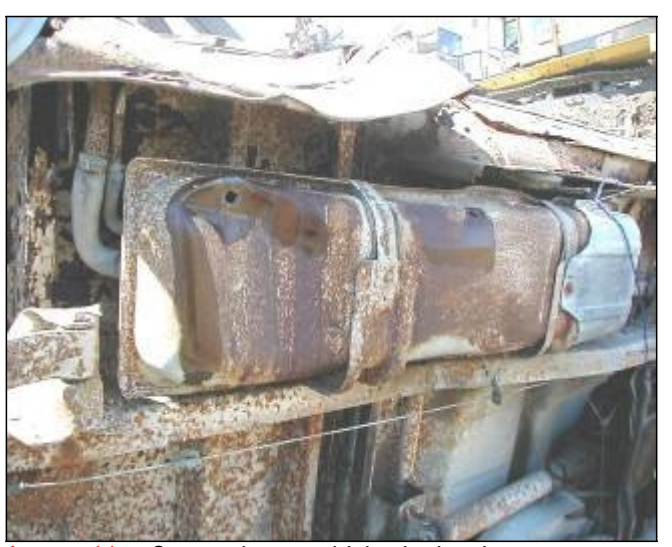
Acceptable: Gas tank on vehicle drained and punctured with two large holes at lowest points prior to delivery to the facility