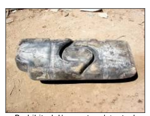
Prohibited: Un-punctured gas tank