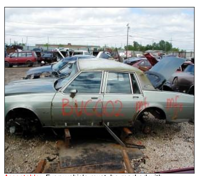
Acceptable: Every vehicle must be marked with customer-specific identification number and the letters "mfr" or "mf"