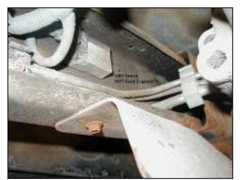
Prohibited: ABS mercury-containing switch located on the chassis on the underside of vehicle