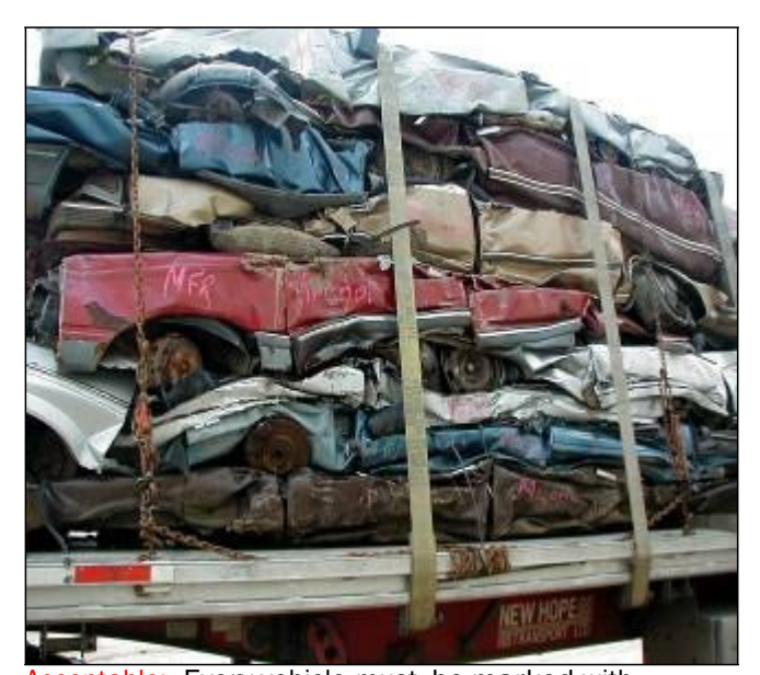
Acceptable: Every vehicle must be marked with customer specific identification number and the letters "mfr" or "mf"