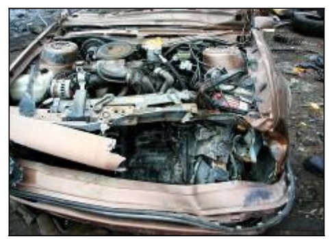
Prohibited: Lead-acid battery left in a vehicle