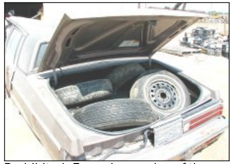
Prohibited: Excessive number of tires