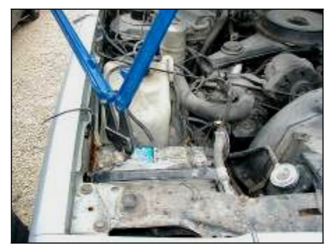
Prohibited: Lead-acid battery left in a vehicle