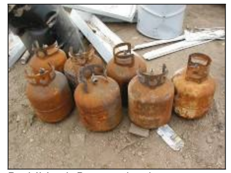
Prohibited: Propane bottles inside vehicles